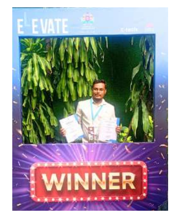
Kakud Post harvest pvt ltd