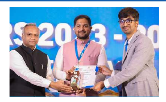
Experimind labs private limited