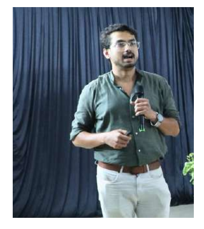
Symgrow technologies private limited

Our startups won the Elevate 100 grant from Government of Karnataka received the award on 24 July 2024