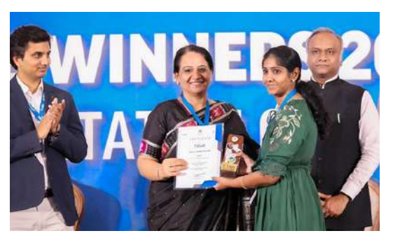
OneShell solutions private limited